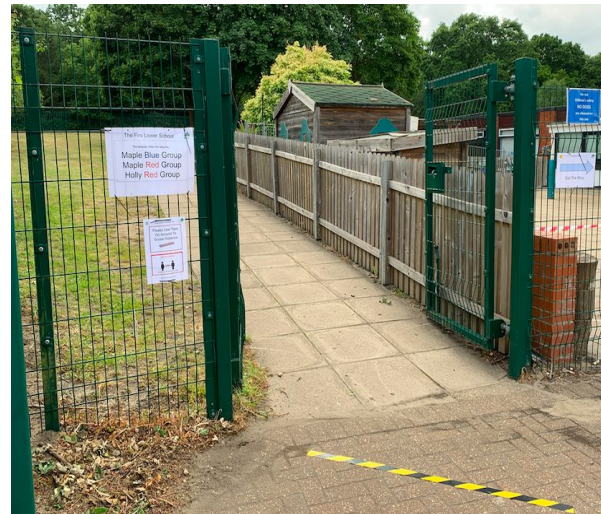
Pic of exiting gate

Pack up carefully. Put your things in your wallet and put the wallet on your chair so your table is left clear and can be cleaned.