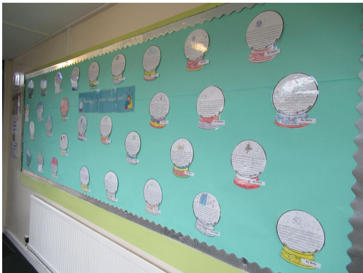
Winter... by Y2