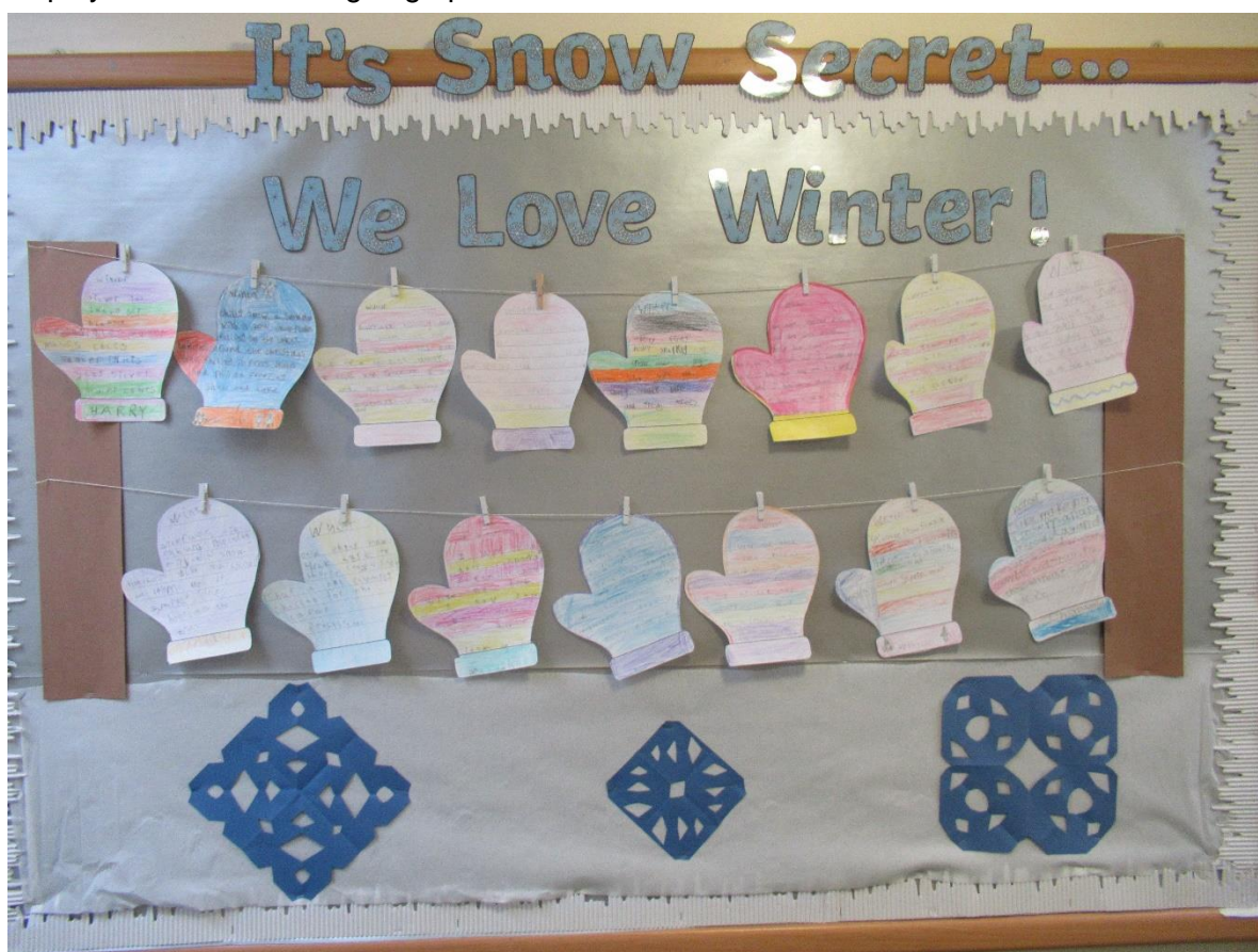
Winter poems from Year 1

As parents are not able to get into school at the moment, we wanted to share with you, some of the lovely displays that have been going up around the school in the last few weeks.