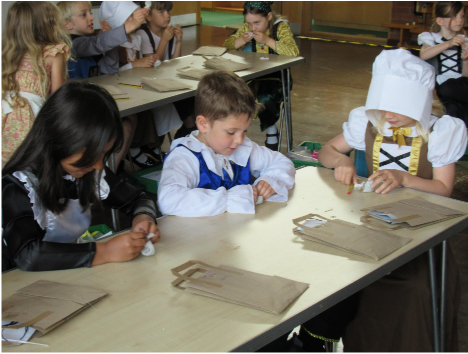
They enjoyed making a Tudor ruff too, even though it was a little fiddly!