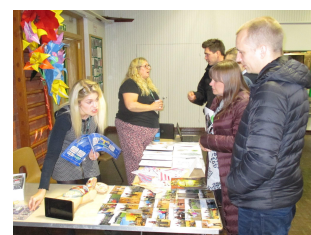
Open Evening 2019

A reminder that we are having an open evening on Monday 18th October at 7pm for parents of children who are due to start school in 2022 and also for parents of children who are preschool age. You will have the chance to meet our staff, have a tour of our school and visit our Saplings pre-school. Refreshments will be served during the evening.