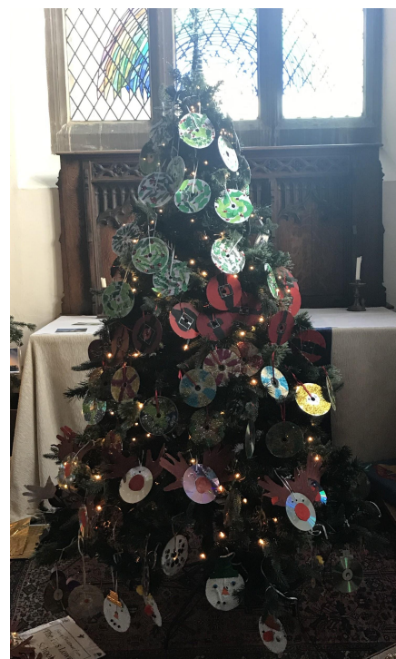
Our tree in 2019