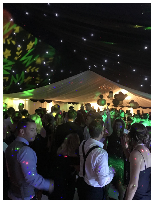
The Ball in 2018!

Let's make the Firs ball a night to remember for us and give our kids new experience and learning support for many years – thank you!