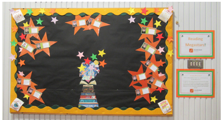
KS2 Accelerated Reader - Reading Megastars Board