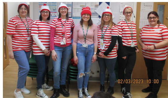
Saplings joined in with the fun too!